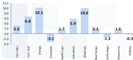
S&amp;P 500 Sector Returns